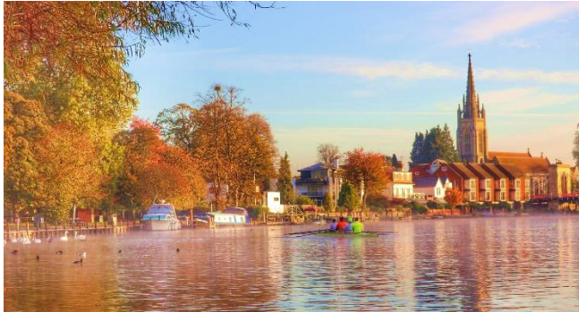
Thanks to MyMarlow