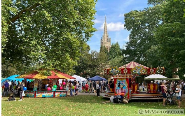
Marlow Carnival 2021.

To ALL Volunteers, Members, Friends and Supporters