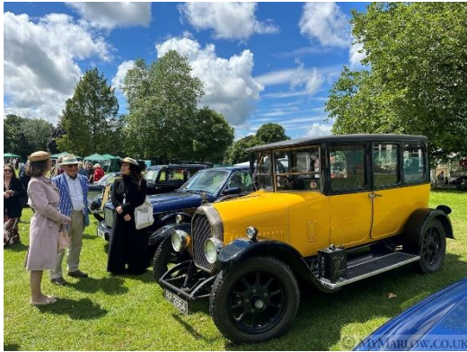
At Marlow Regatta 2024